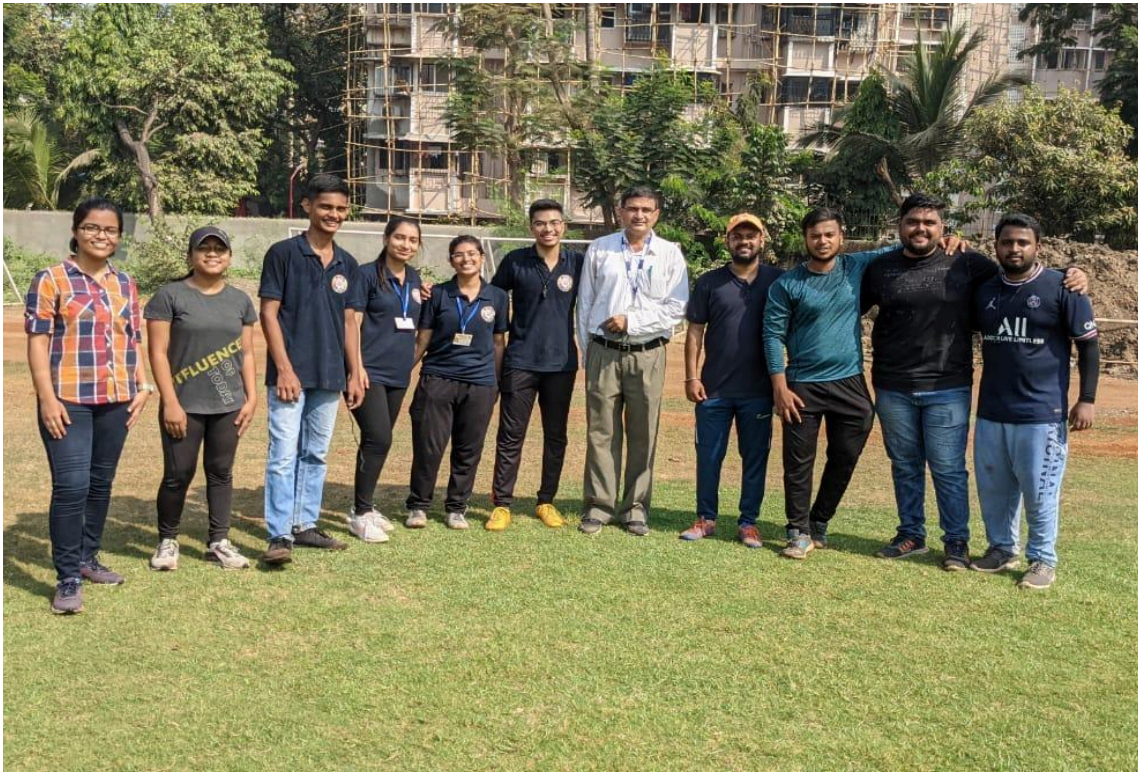
MCA Sports Council