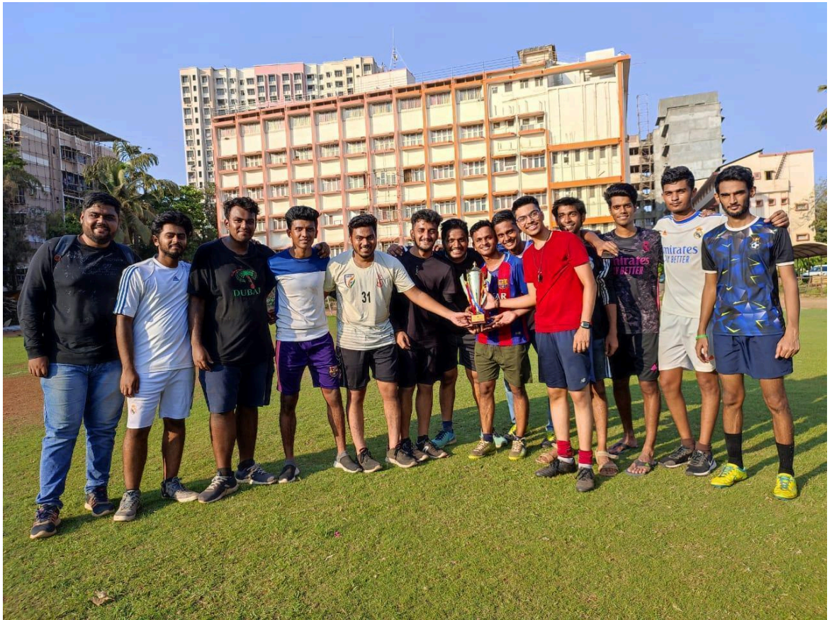
Shreshtha Overall Class winners MCA1 with the winning trophy