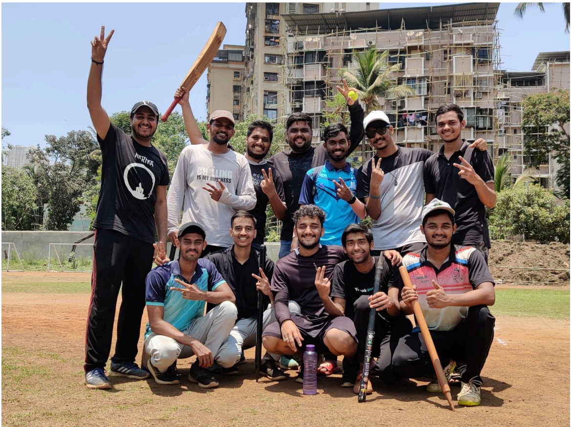
Cricket Winners (MCA1)